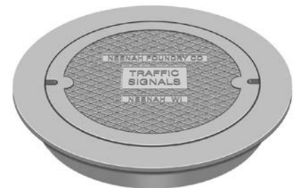
Dimensions in inches